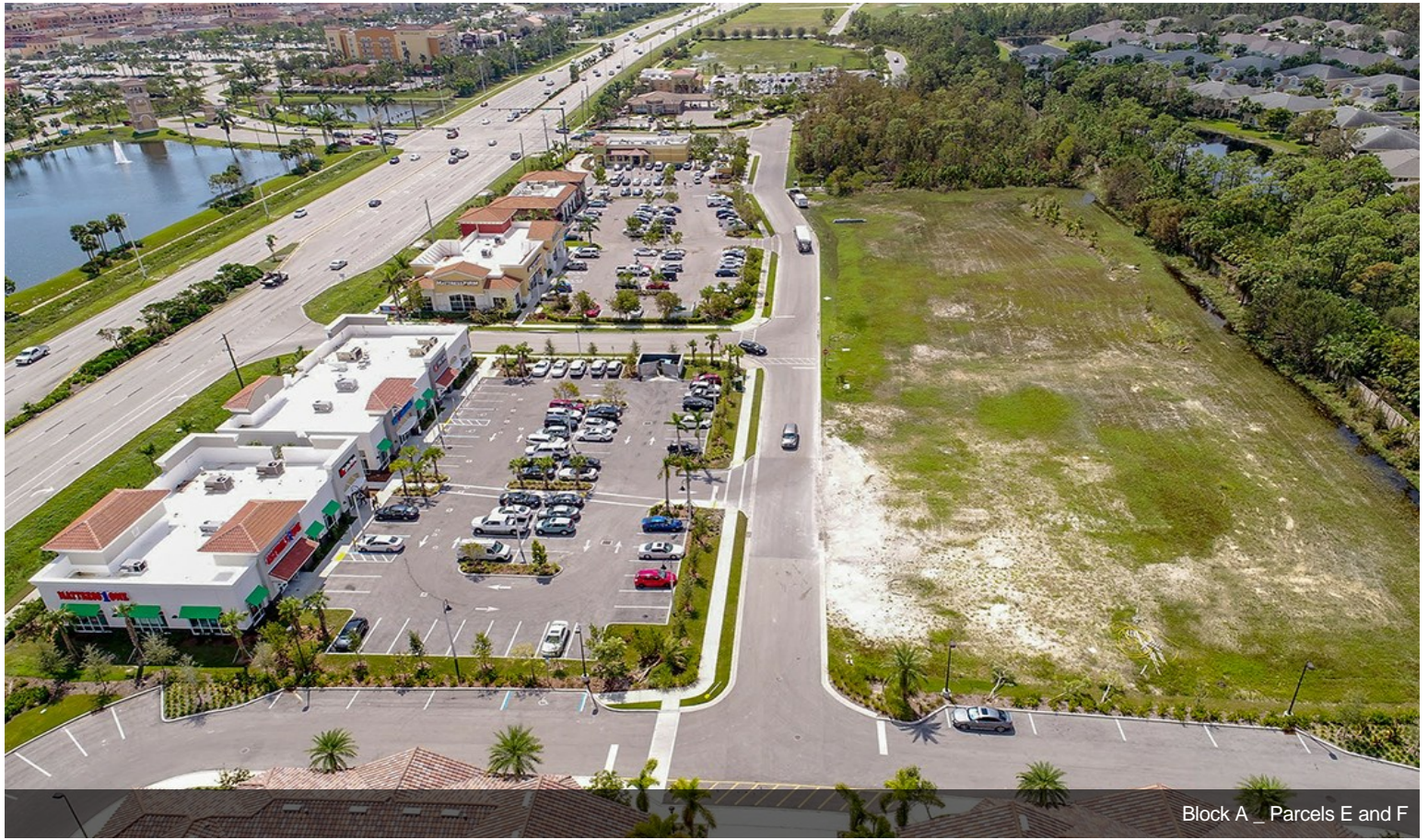
Block A _ Parcels E and F